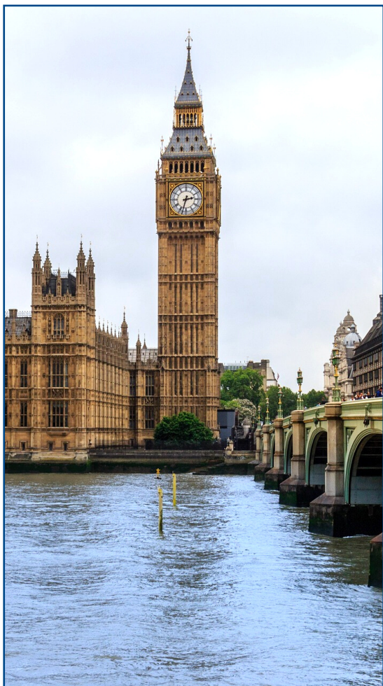
LONDON - BIG BEN

GALA ITALY TOUR: MILAN - [LA SCALA] AND VERONA – [ARENA DI VERONA] (June 29 - July 10, 2023)