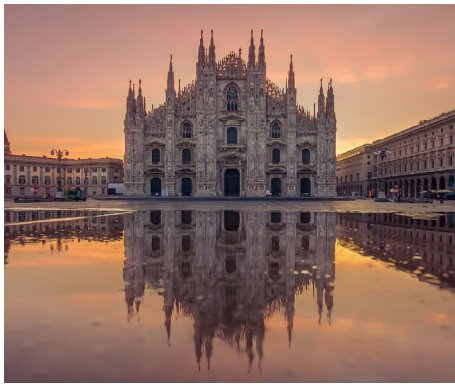
DUOMO DI MILANO