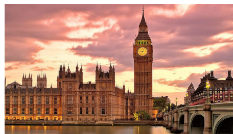
LONDON – BIG BEN & PARLIAMENT

Evening— FREE EVENING to explore London at night, Or— you can choose to attend a WEST END MUSICAL .