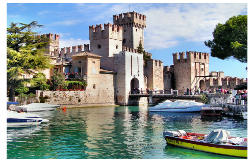
LAKE GARDA – SIRMIONE – CASTLE

[*Note— Transfers can be provided by ICC at cost from and to the designated Arrival and Departure Airports, upon request].