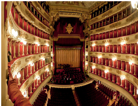
LA SCALA OPERA HOUSE

We'll then drive to the popular Ristorante Don Lisander for our LUNCHEON with wine.