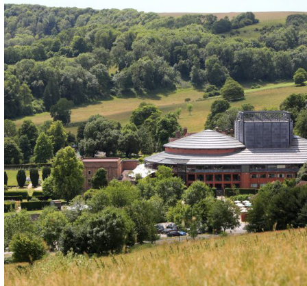
GLYNDEBOURNE OPERA HOUSE

During the long Interval between the Acts, we'll have our bistro-style DINNER with wine at Glyndebourne's Mildmay Restaurant . After " Elisir " our Coach returns us to the Grand .