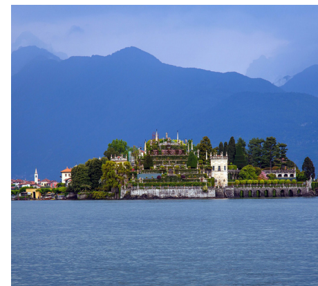
LAKE MAGGIORE– ISOLA BELLA

Evening— This evening is free to rest or explore Milan at night.