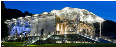
GARSINGTON OPERA HOUSE