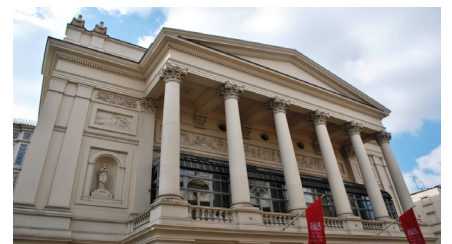
LONDON — ROYAL OPERA HOUSE

Evening— FREE EVENING to explore the lovely Mayfair area or Picadilly; and try another London restaurant on our own.