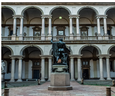
MILAN – PINACOTECA DI BRERA

The afternoon is at leisure, perhaps to explore Milan's famous Fashion District .