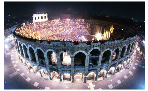
VERONA – ARENA DI VERONA

After " Rigoletto ", we return to the Due Torri .