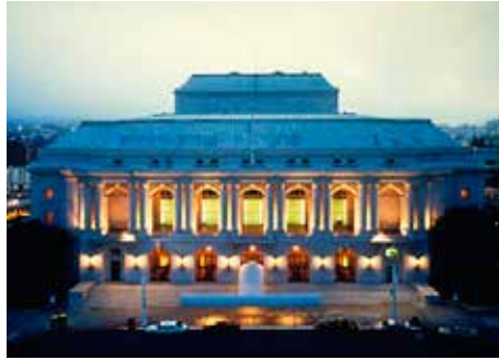
SAN FRANCISCO OPERA HOUSE