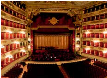
MILAN - TEATRO ALLA SCALA