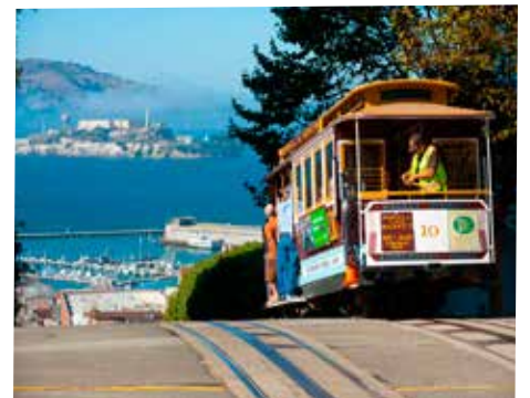
CABLE CAR AT TOP OF HYDE STREET WITH VIEW OF ALCATRAZ

Evening— This evening will be free, to explore San Francisco on our own, the city's many attractions and fine dining.