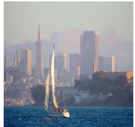
SAN FRANCISCO SKYLINE