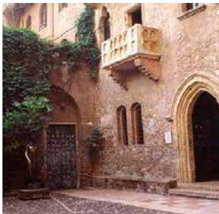
JULIET'S BALCONY - VERONA