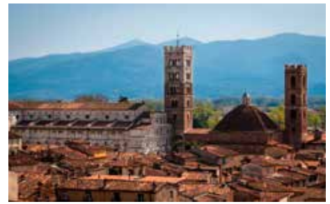
LUCCA - PANORAMA

Evening —Tonight, we meet in the Villa Lobby , and proceed to its Dining Room for our WELCOME LUCCA DINNER with wine.