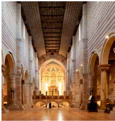
BASILICA SAN ZENO - VERONA