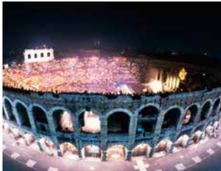
ARENA DI VERONA

Bizet's CARMEN ( Arena Di Verona ). [Cast To Be Announced]