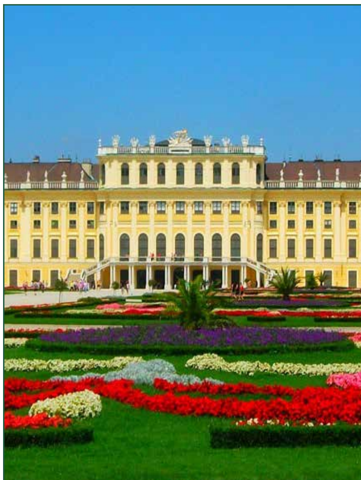
VIENNA – PALACE SCHÖNBRUNN

SAN FRANCISCO WAGNER RING: Wagner's complete Ring Cycle: Runnicles/Zambello Production: