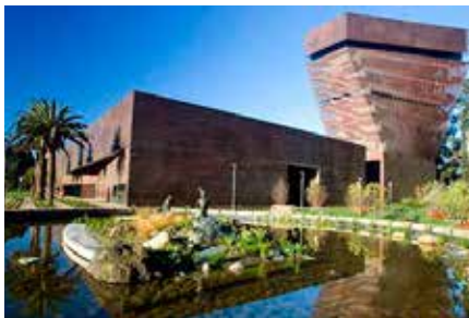
DE YOUNG MUSEUM

After " Siegfried ", our Coach returns us to the St. Francis .