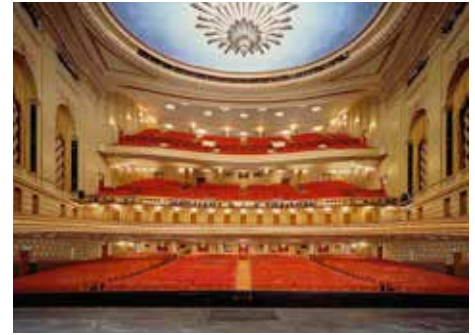
S.F. OPERA HOUSE - INTERIOR