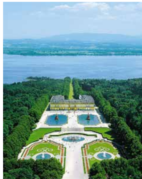
HERRENCHIEMSEE CASTLE & GARDENS

At day's end, we drive to the elegant SCHLOSS FUSCHL - for our Independent cocktail in its Lounge, followed by DINNER with Wine at the FUSCHL TERRACE , with a view of lovely Lake Fuschl , as the sun goes down and lights come on around the Lake.