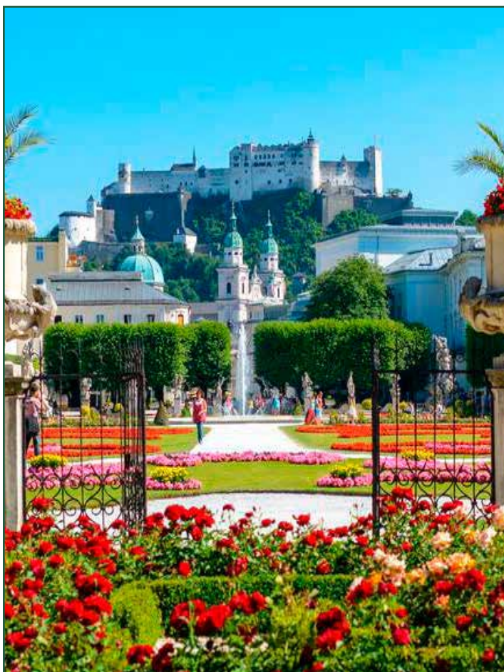
SALZBURG – MIRABELL GARDENS, OLD TOWN & FORTRESS

SALZBURG FESTIVAL (August 17 - 26, 2018)