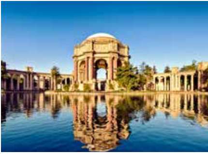
SAN FRANCISCO PALACE OF FINE ARTS