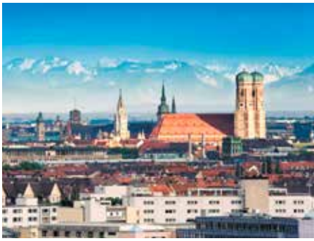
MUNICH - FRAUENKIRCHE