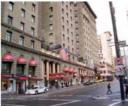
HISTORIC WESTIN ST. FRANCIS HOTEL

We will meet in the St. Francis Lobby and stroll to one of its Private Dining Rooms, for our WELCOME DINNER with wine.