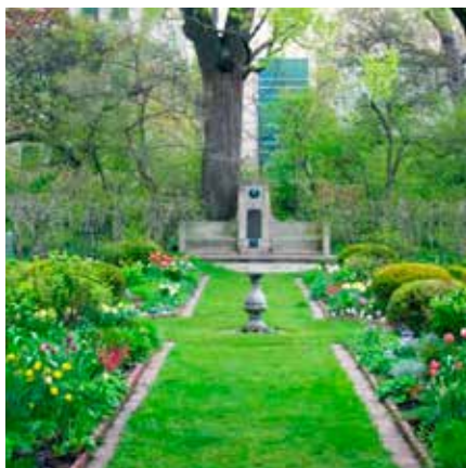
GOLDEN GATE PARK - SHAKESPEARE GARDEN