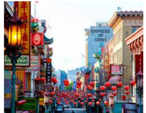
SAN FRANCISCO CHINATOWN

Following " Walküre ", our Coach returns us to the St. Francis .