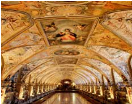
RESIDENZ - HALL OF ANTIQUITIES

Evening — The evening is free to relax, get settled in our Hotel, and explore the city's Restaurants and evening attractions.