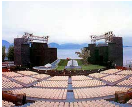
PUCCINI THEATER - TORRE DEL LAGO