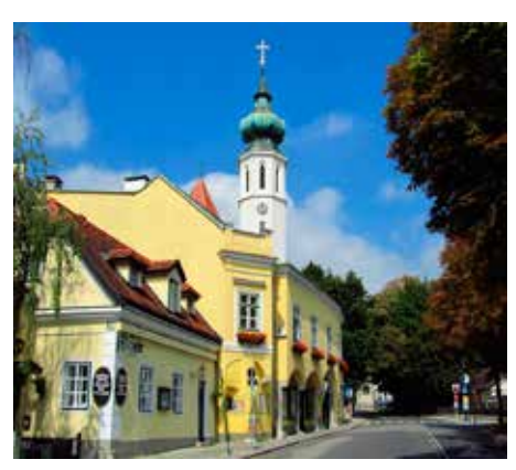
GRINZING - VIENNA WOODS