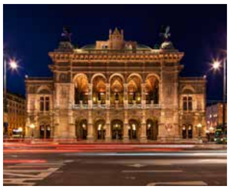
VIENNA STATE OPERA