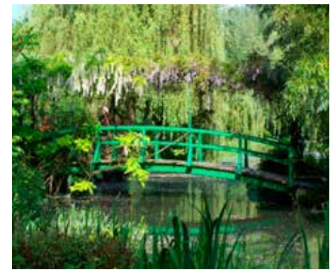
GIVERNY GARDENS - MONET HOME

Evening —Tonight, we meet in the Scribe Lobby and stroll to the renowned Brassrie Le Grand Cafe Des Capucines for our FAREWELL PARIS DINNER with wine.