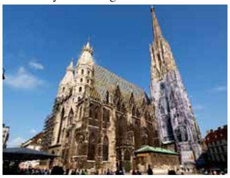
ST. STEPHAN'S CATHEDRAL

FREE DAY, to explore other sights of Vienna on our own, do some shopping or visit another of its many interesting Museums.