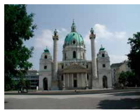
VIENNA - ST. CHARLES CHURCH