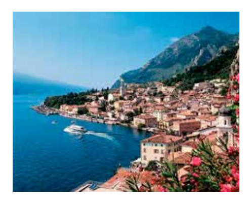
LAKE GARDA - SIRMIONE

Evening — We meet in the Due Torri Lobby , and stroll to the Arena Di Verona to attend—