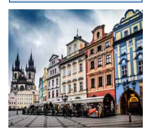
PRAGUE - OLD TOWN SQUARE