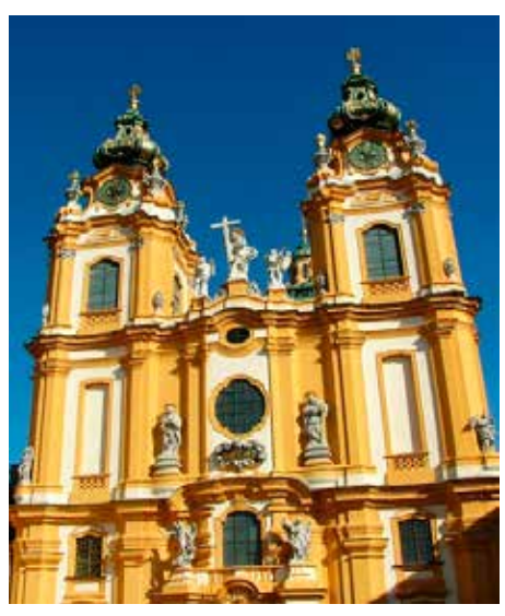
BAROQUE MELK ABBEY