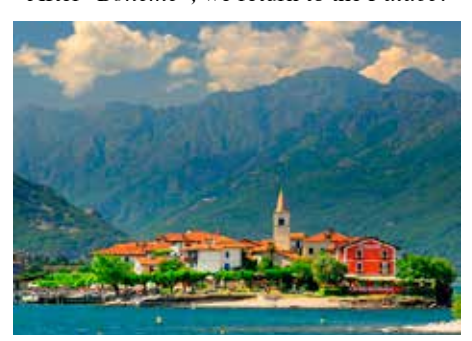
ISOLA BELLA - LAKE MAGGIORE

After "Boheme", we return to the Palace.