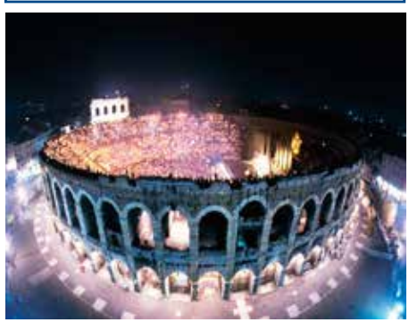
ARENA DI VERONA