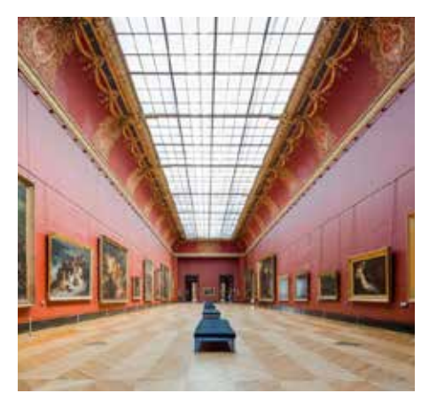
LE LOUVRE MUSEUM

Evening —Tonight, we will meet in the Scribe Lobby and drive to the OPERA BASTILLE to attend Bizet's: