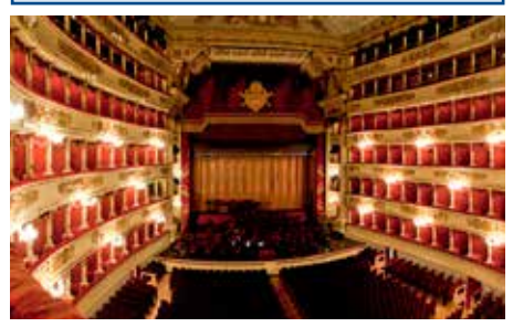
TEATRO ALLA SCALA