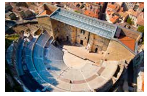
ORANGE ANTIQUE ROMAN THEATER

(Orange Antique Roman Theater). We then return to the Magnaneraie