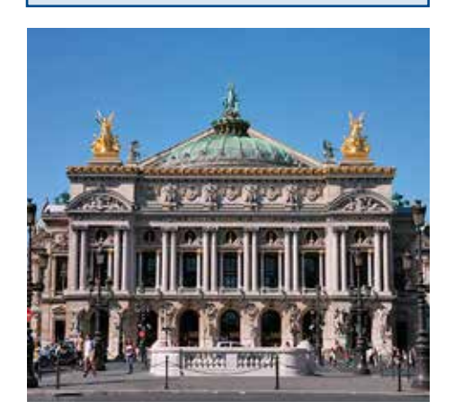
PALAIS GARNIER OPERA HOUSE